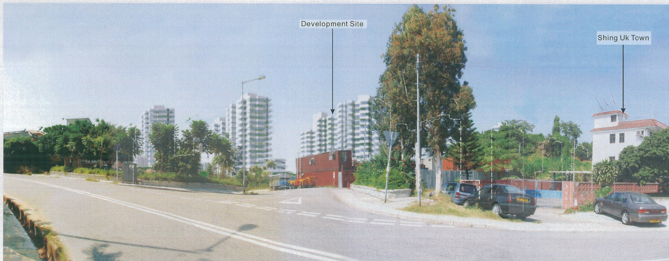
Year 10 of Operational Phase with landscape mitigation measures fully established