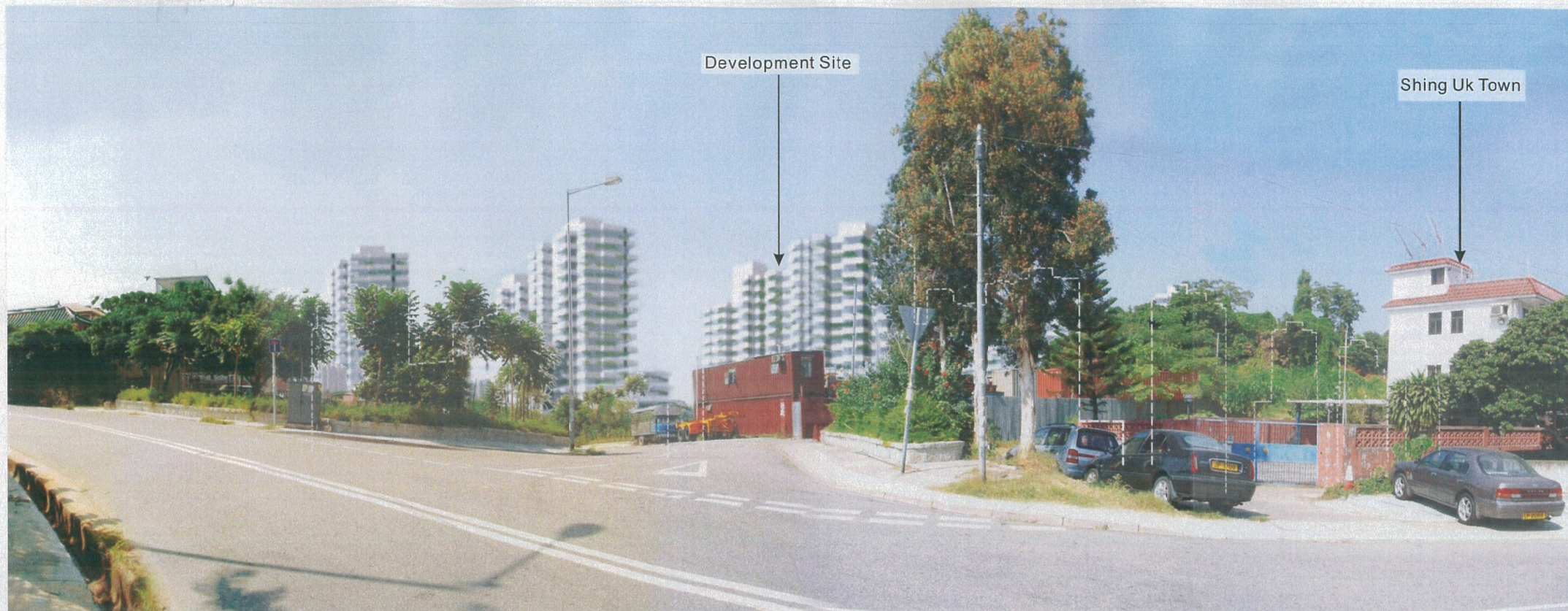
Year 1 of Operation Phase with landscape mitigation measures